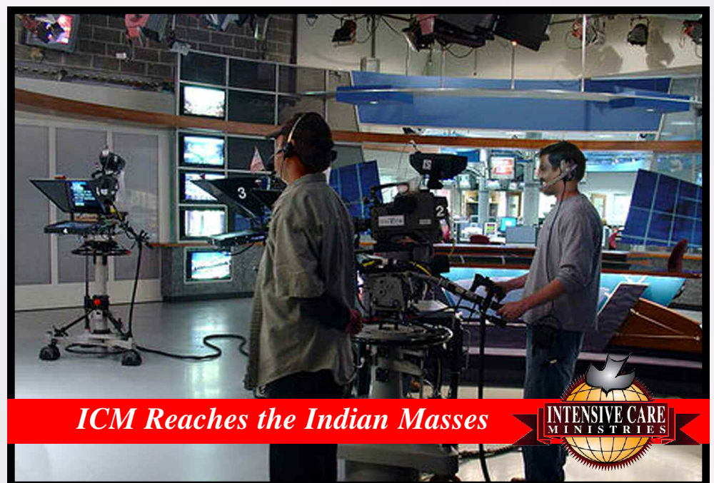
ICM Reaches the Indian Masses